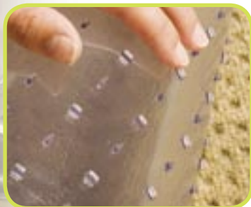
Revolutionary AnchorBar® Chairmat Cleat System

Patent # 6,946,184 & Patent # 7,029,743 Patent # 6,177,165 & # 6,183,833 Manufactured Under Patent # 4,938,677 & # 5,048,182 Patents Pending on Merchandising Systems