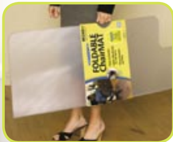
Foldable ChairMAT with Carry Handles and Tabs